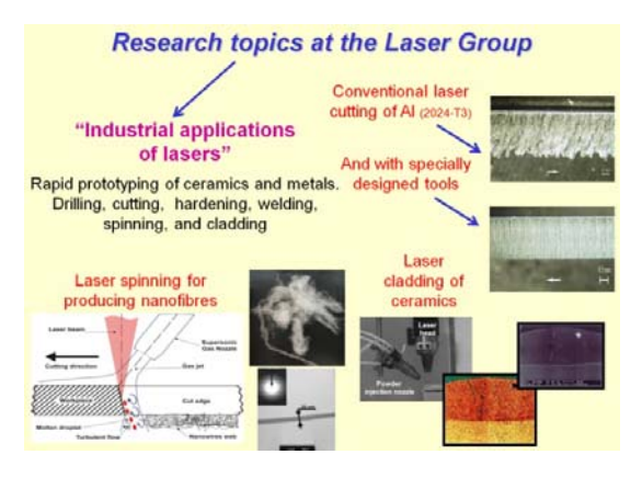
Fig.2 Some research topics of the "Industrial applications of lasers" group