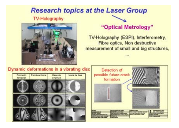
Fig.3 Some research topics of the "Metrology" group