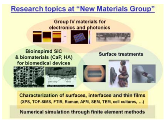
Fig.4 Some research topics of the "New Materials" group